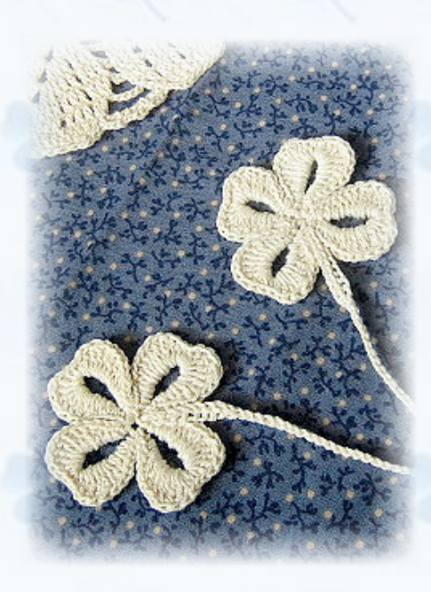
Two rounds of crochet stitches plus a long tail of fringe; probably the simplest crochet bookmark ever!